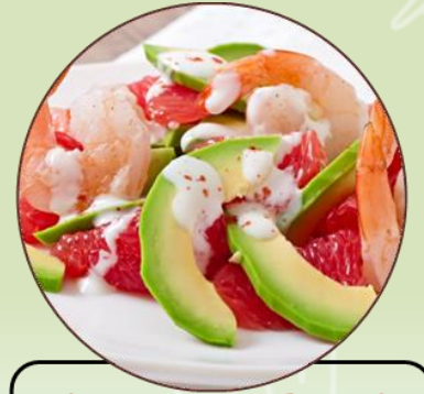
shrimp & fresh fruit salad