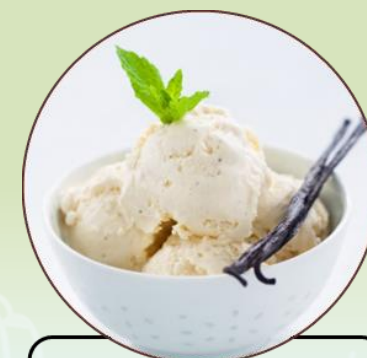
vanilla ice cream