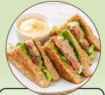
tuna and egg salad sandwiches