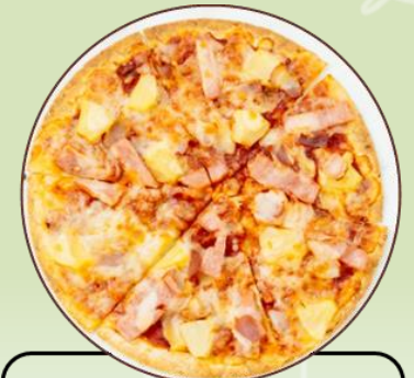
ham, cheese & pineapple pizza