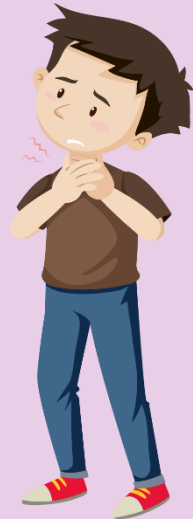
a sore throat